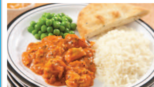
Chicken Tikka Masala served with Rice, Naan Bread & Seasonal Vegetables