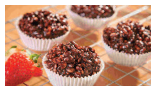
Chocolate Crispy Cake