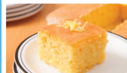
Lemon Drizzle Cake