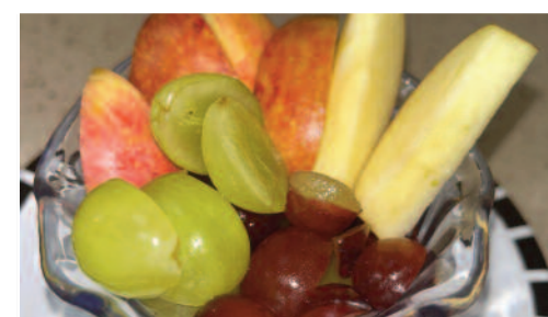
Apple & Grape Pot