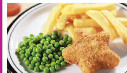
Fish Star (MSC) served with Chips & Peas or Baked Beans

VEGETARIAN VERSIONS OF THE ABOVE MEAL AVAILABLE DAILY