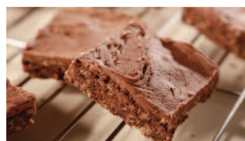
Iced Chocolate Oaty Square