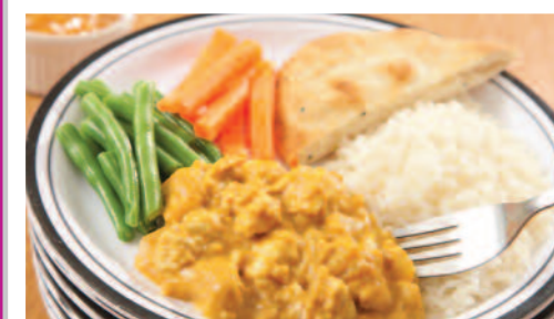
Chicken Korma served with Rice, Naan Bread & Seasonal Vegetables