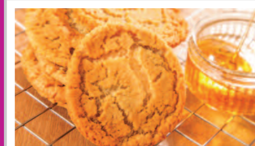
Golden Crunch Cookie

AVAILABLE EVERY DAY – UNLIMITED SALAD, FRESHLY BAKED BREAD, FRUIT YOGHURT & FRESH FRUIT PLATTER. FOR ALLERGEN INFORMATION, PLEASE ASK ONE OF OUR CATERING TEAM. ALL THE ABOVE DISHES ARE SUBJECT TO AVAILABILITY.