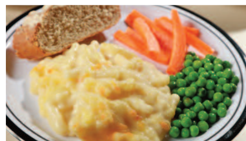
Mac 'n' Cheese served with Garlic & Herb Bread and Seasonal Vegetables