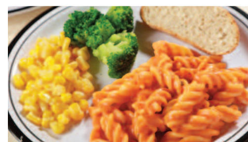
Tomato & Mascarpone Cheese Pasta served with Garlic & Herb Bread and Seasonal Vegetables