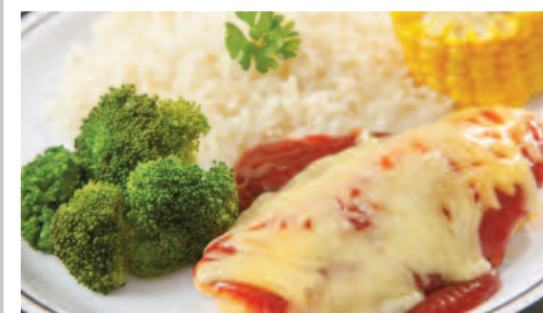
BBQ Chicken served with Savoury Rice and Seasonal Vegetables