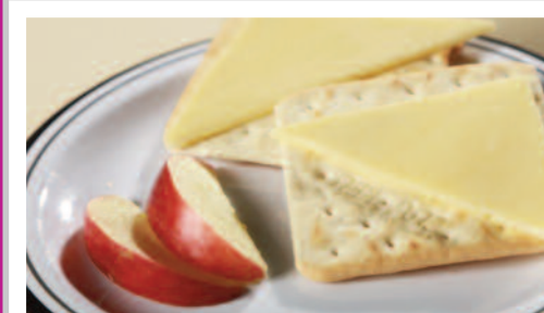
Cheese & Crackers