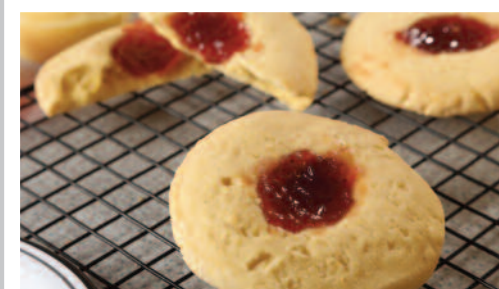
Jam & Custard Biscuit